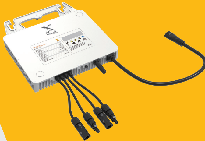
X1-Micro 800 / X1-Micro 900 / X1-Micro 1000 / X1-Micro 1200

The Solax X1-Micro series is renowned for its exceptional power output, positioning itself as one of the top-rated models among 2-in-1 microinverters, boasting an impressive capacity of up to 1200 VA. Specifically designed to cater to the latest and previous generation of high-power modules, these microinverters feature two independent MPPTs and robust support for input current and output power. Seamlessly incorporating Wi-Fi wireless technology, the X1-Micro series ensures reliable and consistent communication, offering users a smooth monitoring and control experience. Delivering a cost-effective solution, these microinverters are highly suitable for both residential and commercial solar applications. Furthermore, they are fully compatible with the Solax Hybrid system and seamlessly integrate with various AC coupled systems available in the market, thus enhancing their versatility and adaptability.